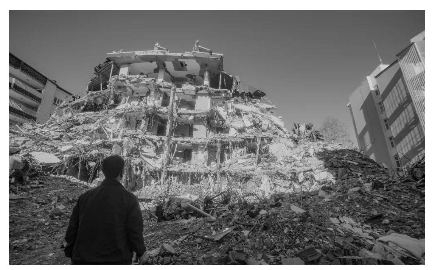
View after the eathquake